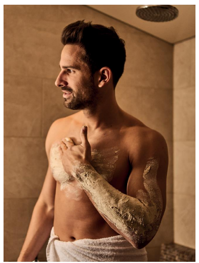
ALOE VERA CARE PACK

Aloe vera is a real thirst quencher for the skin! The goat's butter aloe vera gel moisturizes, smoothes and plumps, has an anti-inflammatory effect and soothes irritated or damaged skin, combining with shea butter and evening primrose to create a valuable skin elixir that prevents wrinkles. Provides a radiant, refreshed complexion.